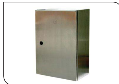
Ausrack IP stainless steel