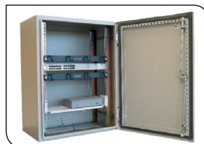
Ausrack IP zinc coated steel

Ausrack IP has a wide range of accessories available to suit any application.